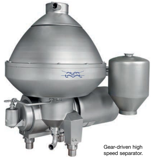
Gear-driven high speed separator.