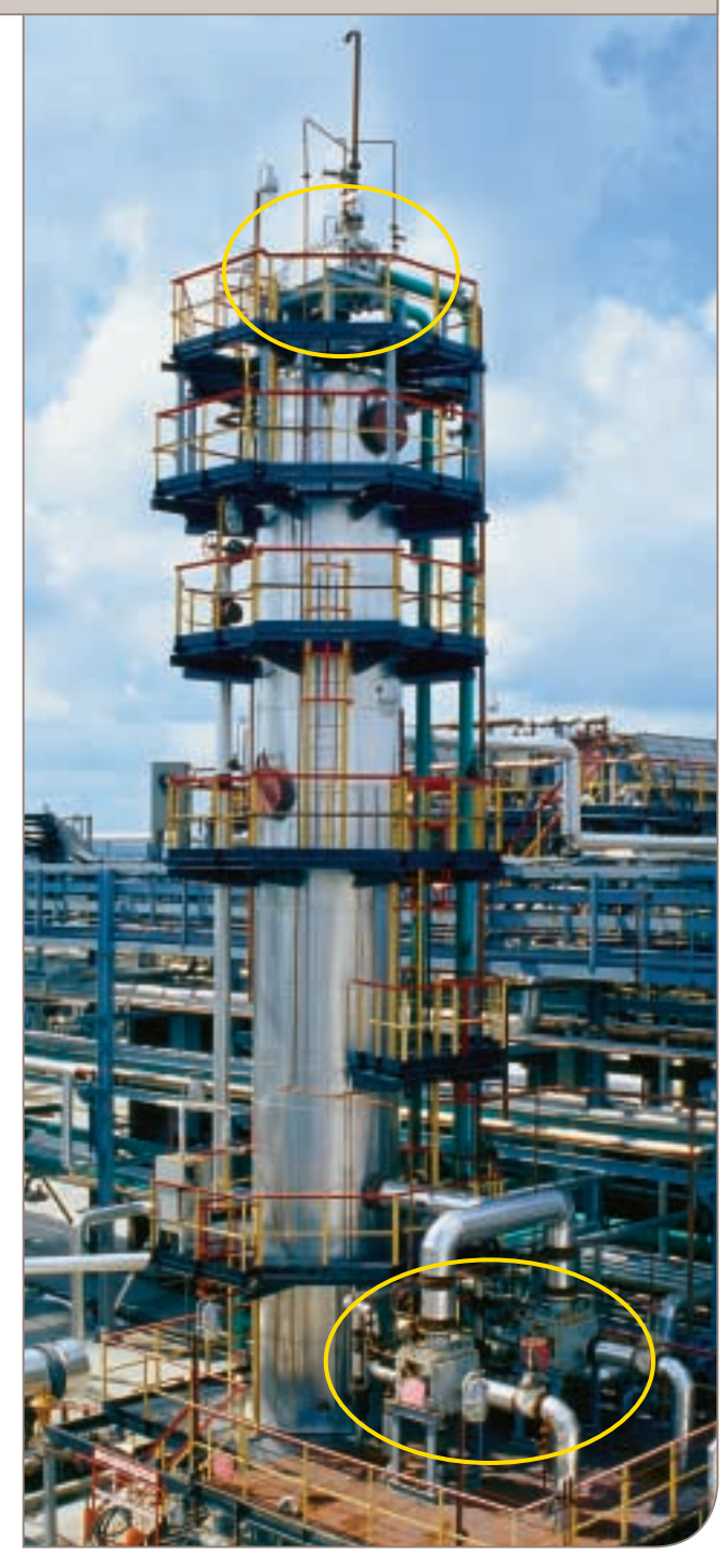
Stripper tower in gas sweetening process, with reboilers and reflux condenser marked with circles (close-ups on next page)

The decision to install the extremely compact Compabloc solution instead of traditional shell-and-tube units enabled YUKOS to save both money and space. The Compabloc reboilers have been in operation since January 2002, and the general consensus of opinion at the Syzran refinery is that the Compabloc units work extremely well.