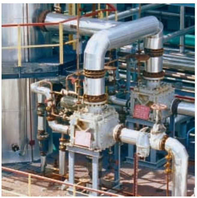
Compabloc reboilers operating with steam as heating medium

Compabloc is the most compact reboiler solution available on the market today. The reboilers installed at the YUKOS plant are a good example of the Compabloc thermosiphon concept. While one unit would have been adequate, the customer chose to install two parallel units in order to prevent any unnecessary shutdowns during cleaning procedures. Circulation of the medium is carried out by means of the thermosiphon system.